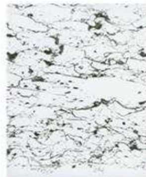
Typical microstructure of SA8222 sprayed with SmartArc

Technical features can be tailored to application.