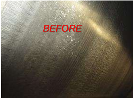
Full Range PR Rolls On Site Roll Service Solutions

Hard and Mirror-Finished Surface Coatings